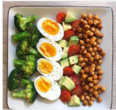
Simple meals are the best meals! Savory goodness made in less then 10 minutes for breakfast or lunch... . Two hard